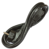
2 IEC cords