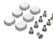
Fastening set for rackmount case