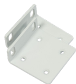
Rackmount bracket white