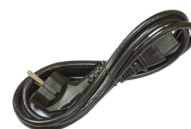
2x IEC cord